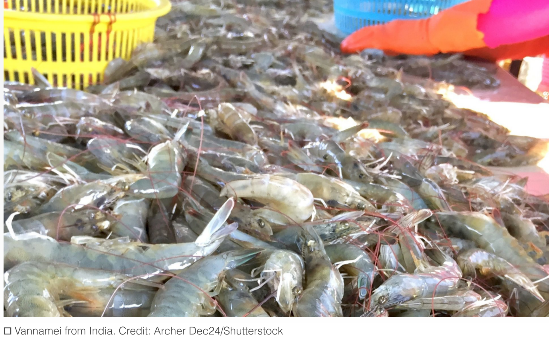
□ Vannamei from India.