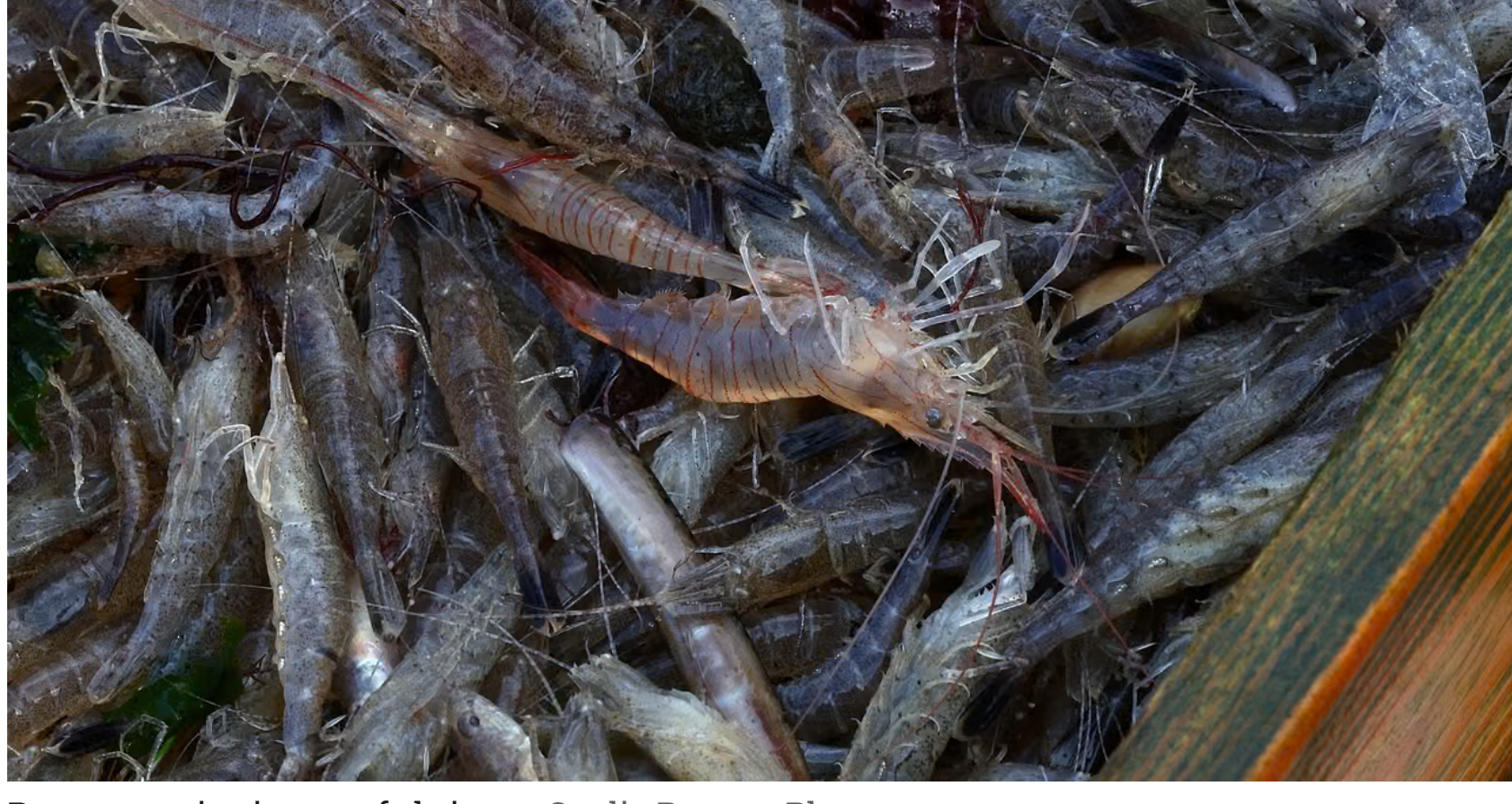
Representative image of shrimps.

Washington: An American Senator has sought action from the US Trade Representative alleging that the shrimp imported from India relies on forced labour and is 'pumped full of illegal antibiotics'.