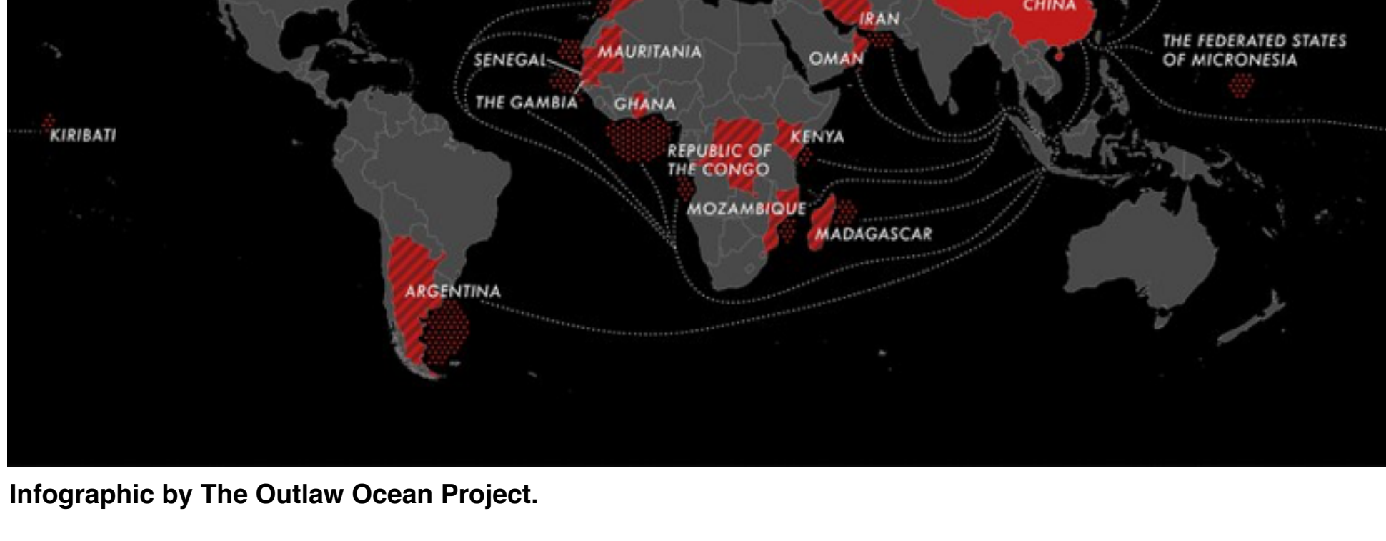
Infographic by The Outlaw Ocean Project .

In recent years, from South America to Africa to the far Pacific, China has increasingly taken a "softer" approach, gaining control from the inside through legal means by paying to flag in their ships so they can fish in domestic waters without the risk of political clashes, bad press, or sunken vessels.