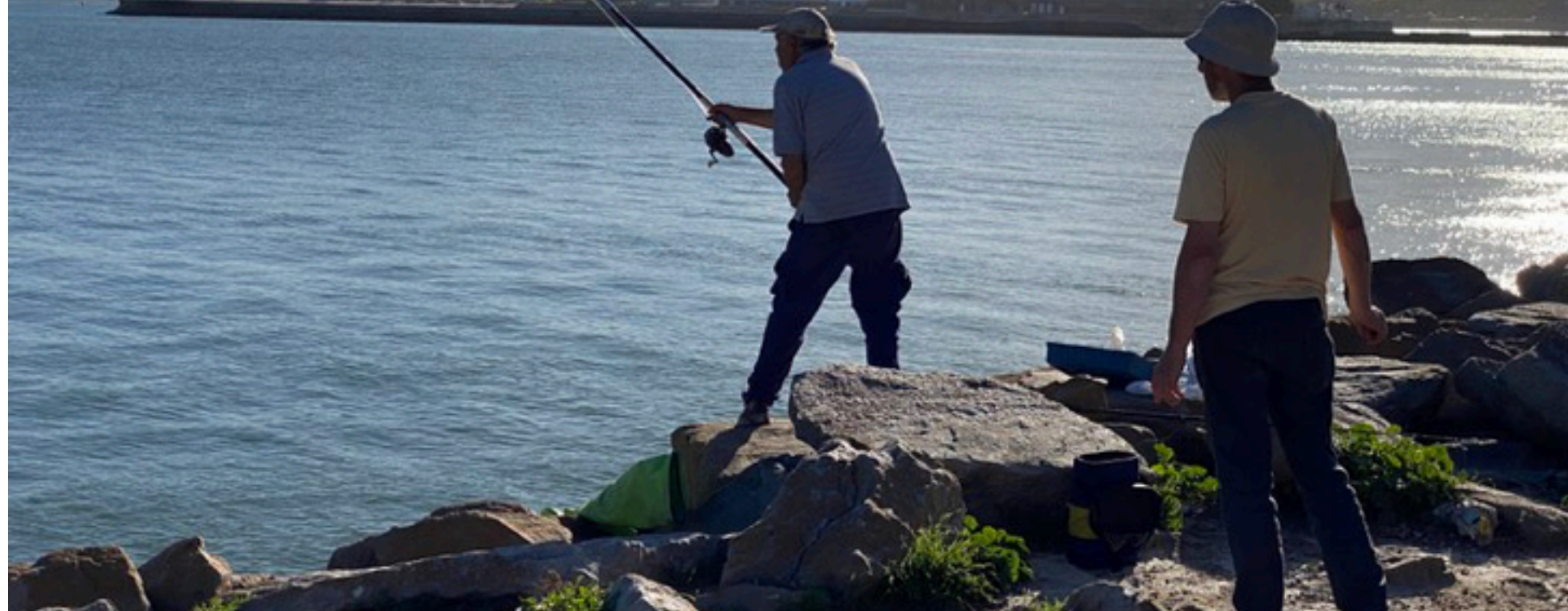
Two local men fish in Mar del Plata, Argentina, in March 2024.

Still, China has a well-documented reputation for violating international fishing laws and standards, intruding on the maritime territory of other countries and abusing its fishing workers.