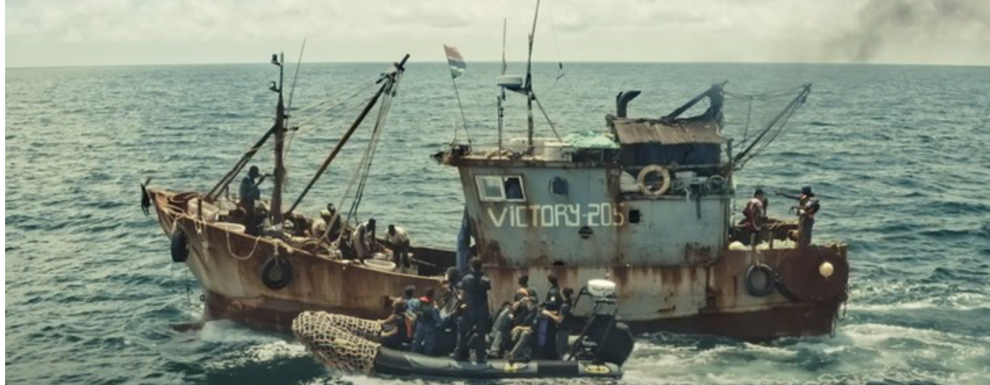
In August 2019, a reporting team inspected a Chinese fishing vessel off the coast of West Africa.

In Africa, Chinese companies operate flagged-in ships in the national waters of at least nine countries. In the Pacific, an inspection in 2024 by local police and the U.S. Coast Guard found that six Chinese flagged-in ships in the waters of Vanuatu had violated regulations requiring them to record their catch in logbooks.