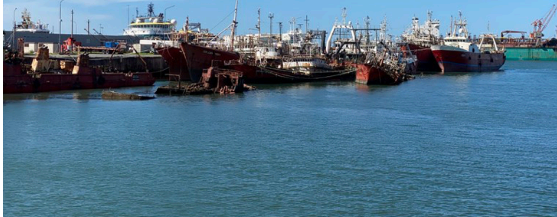
Mar del Plata is Argentina's largest fishing port and the headquarters for many fishing companies. Many Argentine-owned fishing vessels have, however, been neglected in recent years. In some parts of Mar del Plata's port, those vessels now sit neglected or sunken, unguessed and unsalvageable.

Trade records show that some of the seafood caught on these vessels is exported to countries including the United States, Canada, Italy, and Spain.