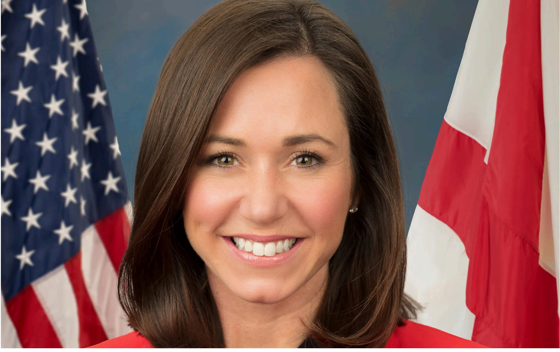
U.S. Senator Katie Britt (R-Alabama) and U.S. Senator Rick Scott (R-Florida) claimed illegal, unreported, and unregulated (IUU) fishing in China’s seafood industry is a threat to national security

A pair of senators from the United States have sent a letter to U.S. Secretary of Commerce Howard Lutnick, demanding the federal government issue “the toughest possible sanctions on seafood from China” over human rights violations in its commercial fishing industry.