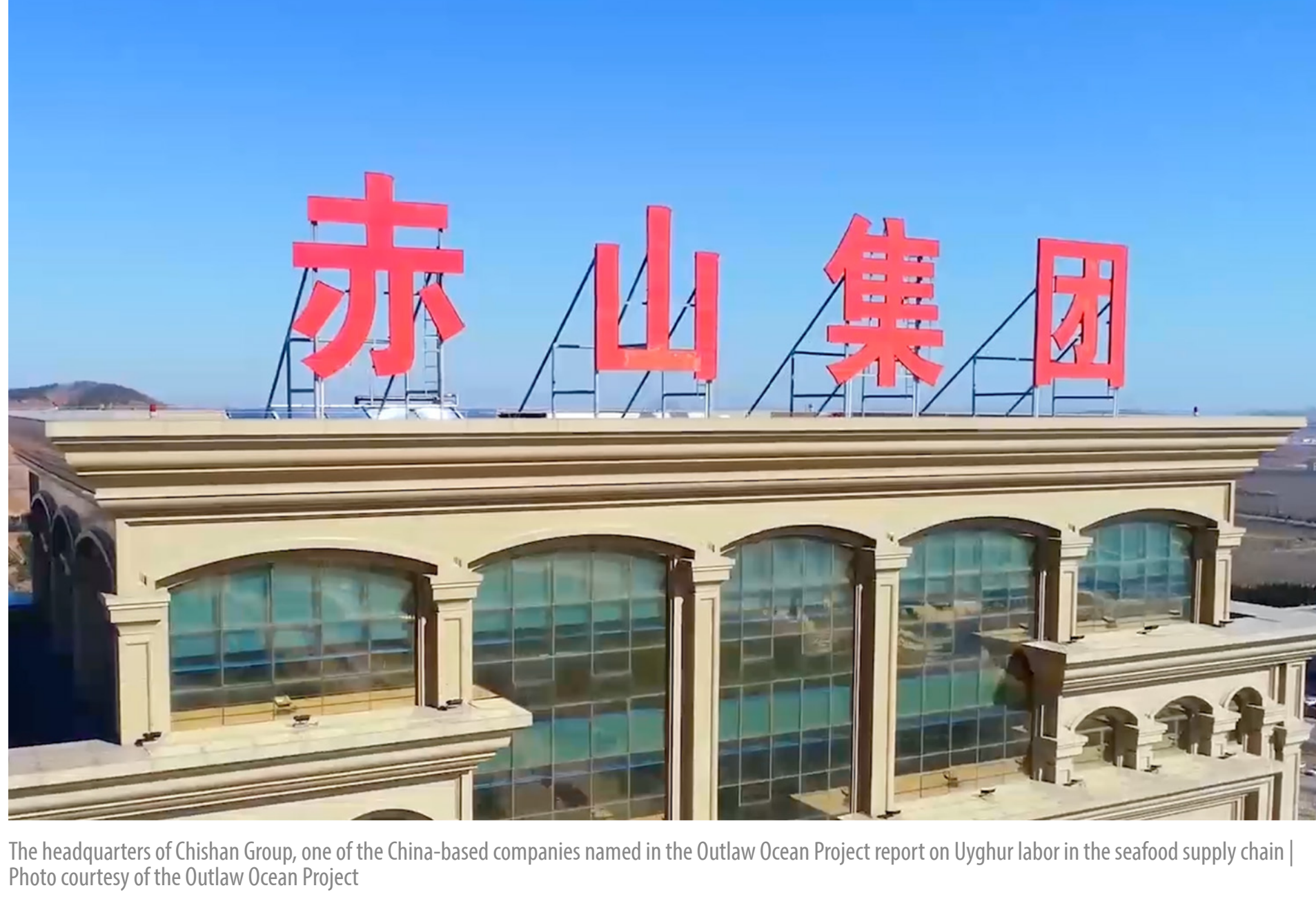
The headquarters of Chishan Group, one of the China-based companies named in the Outlaw Ocean Project report on Uyghur labor in the seafood supply chain

A group of U.S. government representatives, including U.S. House Natural Resources Committee Ranking Member Raúl M. Grijalva (D-Arizona), and a pair of Canada-based NGOs are pushing the U.S. and Canadian governments to step up enforcement against illegal, unreported, and unregulated (IUU) fishing and human rights violations identified in an Outlaw Ocean report.