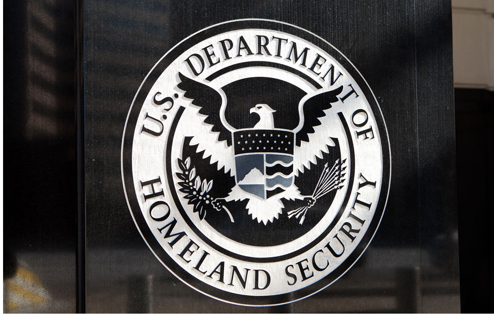
The Southern Shrimp Alliance wants the U.S. Department of Homeland Security to add another seafood company to the Uyghur Forced Labor Prevention Act's entity list

The Southern Shrimp Alliance (SSA) is asking the U.S. Forced Labor Enforcement Task Force (FLETF) to add Rongcheng Sanyue Foodstuff to the U.S.'s Uyghur Forced Labor Prevention Act's (UFLPA) entity list – a move which would effectively ban the import of any product from the company.