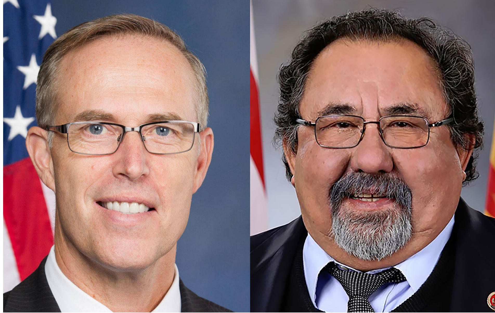
Representatives Jared Huffman (D-California) and Raúl M. Grijalva (D-Arizona) spearheaded a bipartisan letter calling for President Biden to do more to tackle IUU fishing

A bipartisan group of lawmakers from the U.S. House of Representatives has sent a letter to U.S. President Joe Biden urging him and the administration to take increased action against illegal, unreported, and unregulated (IUU) fishing.