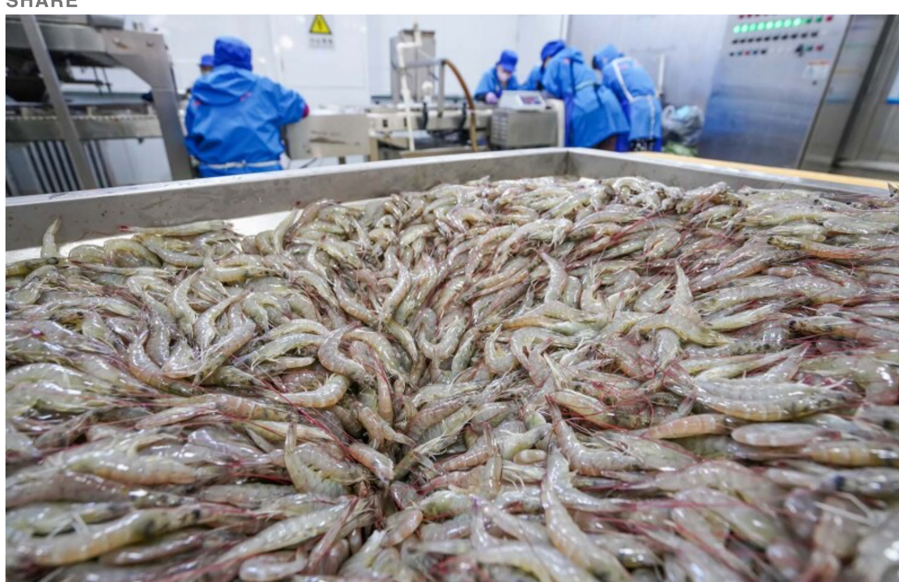
Another Chinese seafood processing plant operating in Shandong province was added to the Entity List maintained under the Uyghur Forced Labor Prevention Act.