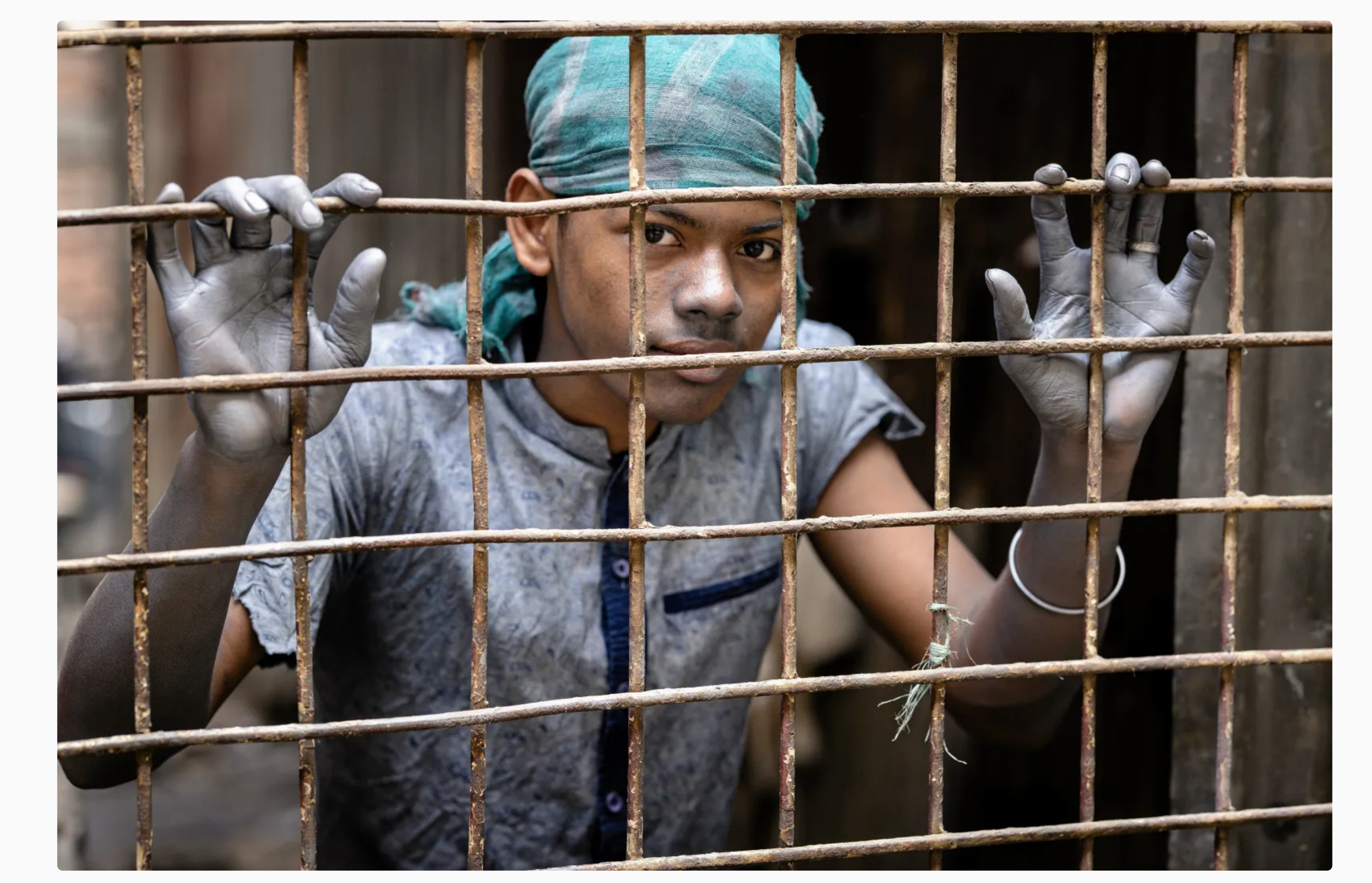
The Outlaw Ocean Project revealed evidence of forced labor of Uyghurs workers transferred from the Xinjiang Uyghur region to seafood processing factories in the Shandong province of China that have supplied US companies as well as the US government.

The companies pledged to investigate their supply chains following a sweeping investigation from the nonprofit Outlaw Ocean Project.