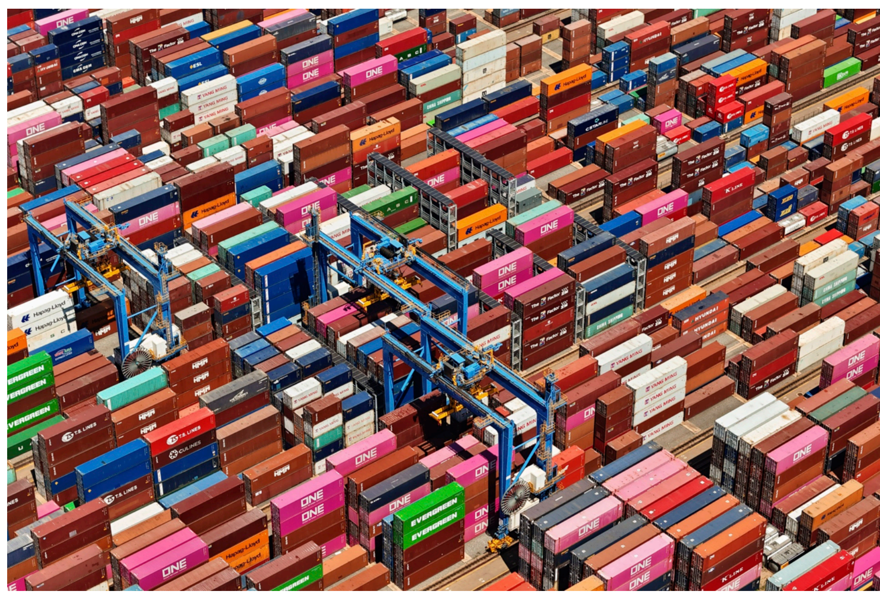
An aerial view of a container port is seen in Qingdao in east China's Shandong province Thursday, June 6, 2024.

The three blacklisted companies are Dongguan Oasis Shoes, Xinjiang Shenhua Coal and Electricity, and the Shandong Meijia Group. Xinjiang Shenhua Coal manufactures electrolytic aluminum, while Shandong Meijia, which also does business as Rizhao Meijia, processes seafood.