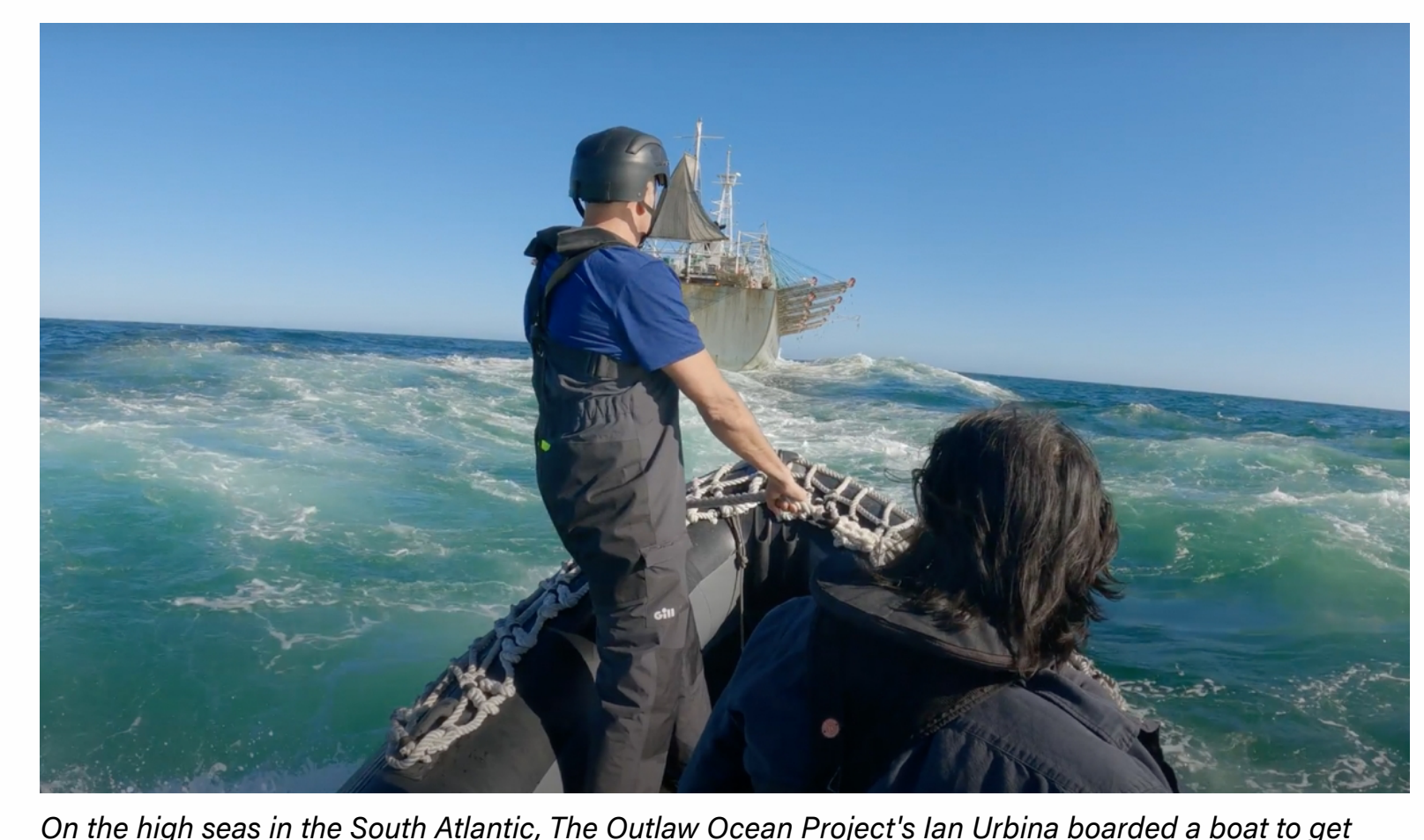
closer to a Chinese squid ship.

NEW YORK, June 20, 2024 — Asia Society is pleased to announce that the 2024 Osborn Elliott Prize for Excellence in Journalism on Asia is being awarded to The Outlaw Ocean Project, a nonprofit journalism outlet based in Washington, D.C., for "China: The Superpower of Seafood." The $10,000 cash award is given annually by an independent jury to the best example of journalism about Asia during the previous calendar year.