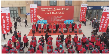
Report: Chinese plants using forced Uyghur labor supplying major European, US retailers

any goods, wares, articles, or merchandise mined, produced, or manufactured in the Xinjiang Uygher autonomous region of China, and under the Tariff Act, it is illegal to import into the US any goods